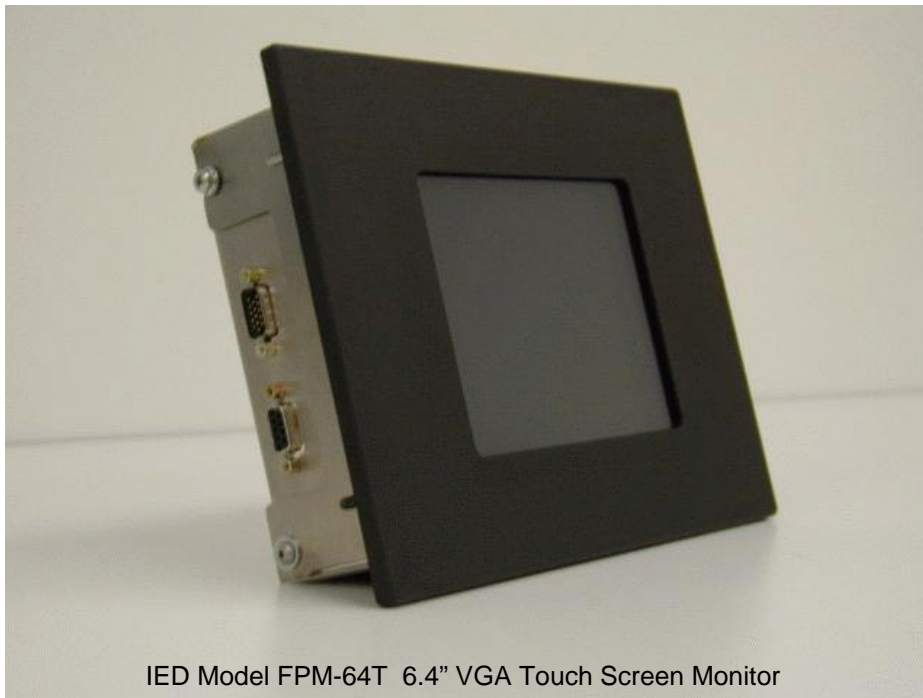
IED Model FPM-64T 6.4" VGA Touch Screen Monitor

The FPM-64T is fitted with a high resolution analog resistive touch screen. Available either as a serial RS-232 interface or a PC bus card, the touch screen provides a mouse emulation, supporting Click, Double Click, and Click and Drag, including Right Click functionality!